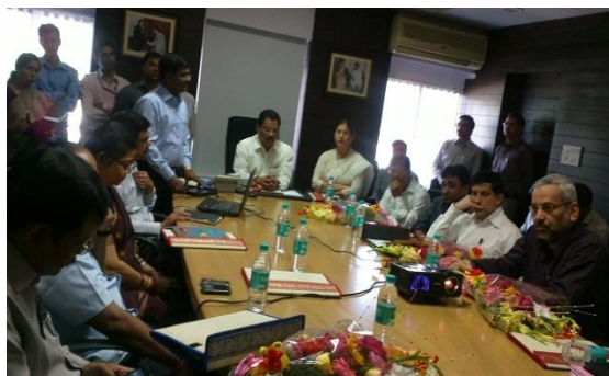
Hon. State Health Minister Prof. (Smt.) Fauzia Khan addressing