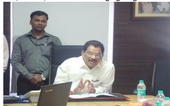
Hon Health Minister Shri Suresh Setty addressing