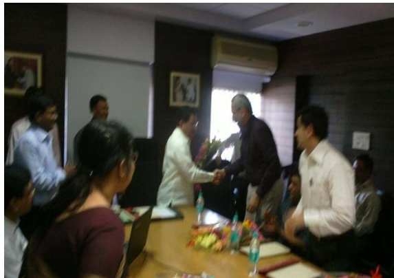
SIO, Maharashtra Shri Moiz Hussain being felicitated by Hon. Health Minister Maharashtra